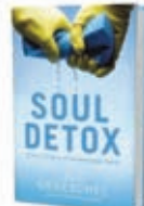
SOUL DETOX BY: CRAIG GROESCHEL