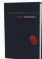
SOUL CRAVINGS BY: ERWIN MCMAUS