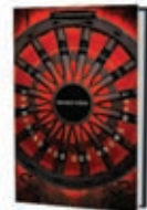
SEARCHING FOR GOD KNOWS WHAT BY: DONALD MILLER